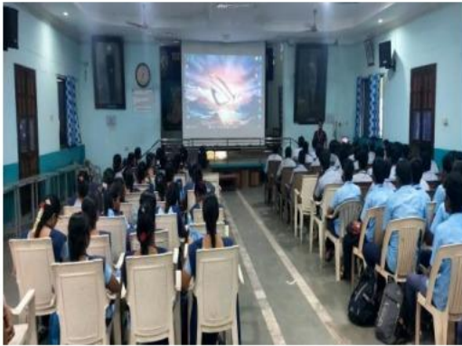
Image Creative Education, Trichy enriched students with an in depth understanding of 3D modelling concepts, workflows, and tools, with a specific focus on Maya software.

Computer Engineering Department organized a seminar to provide the students integrated learning experience on 30.12.2024 for 3D Modelling and Breakdowns as part of the broader Emerging Technology seminar series.