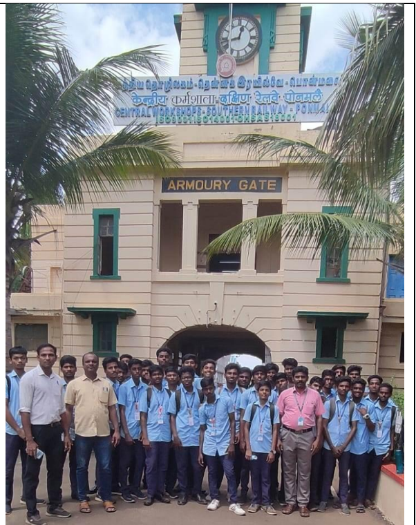
Final year mechanical engineering students visited Golden Rock Railway work shop 12-10-2022