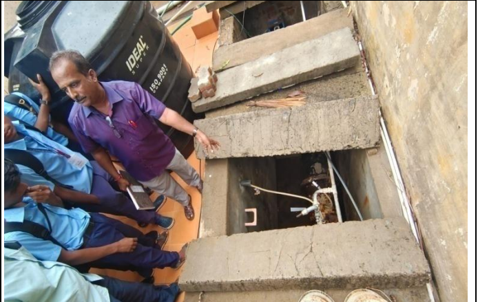
Disinfection unit -Demonstration by the Engineer in-charge