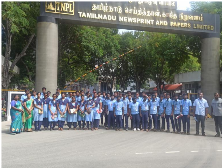
Final year Computer Engineering students and staff visited TNPL Karur on 08.10.2022